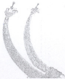
The Manthan-AIF Award